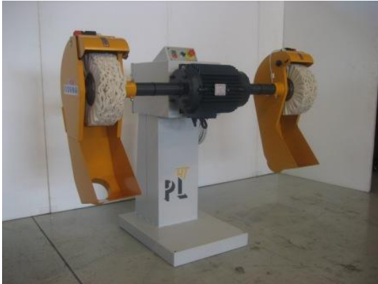
Buffering - Polishing machine Twin shaft with self ventilated disk