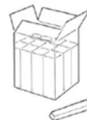
Anti static paste